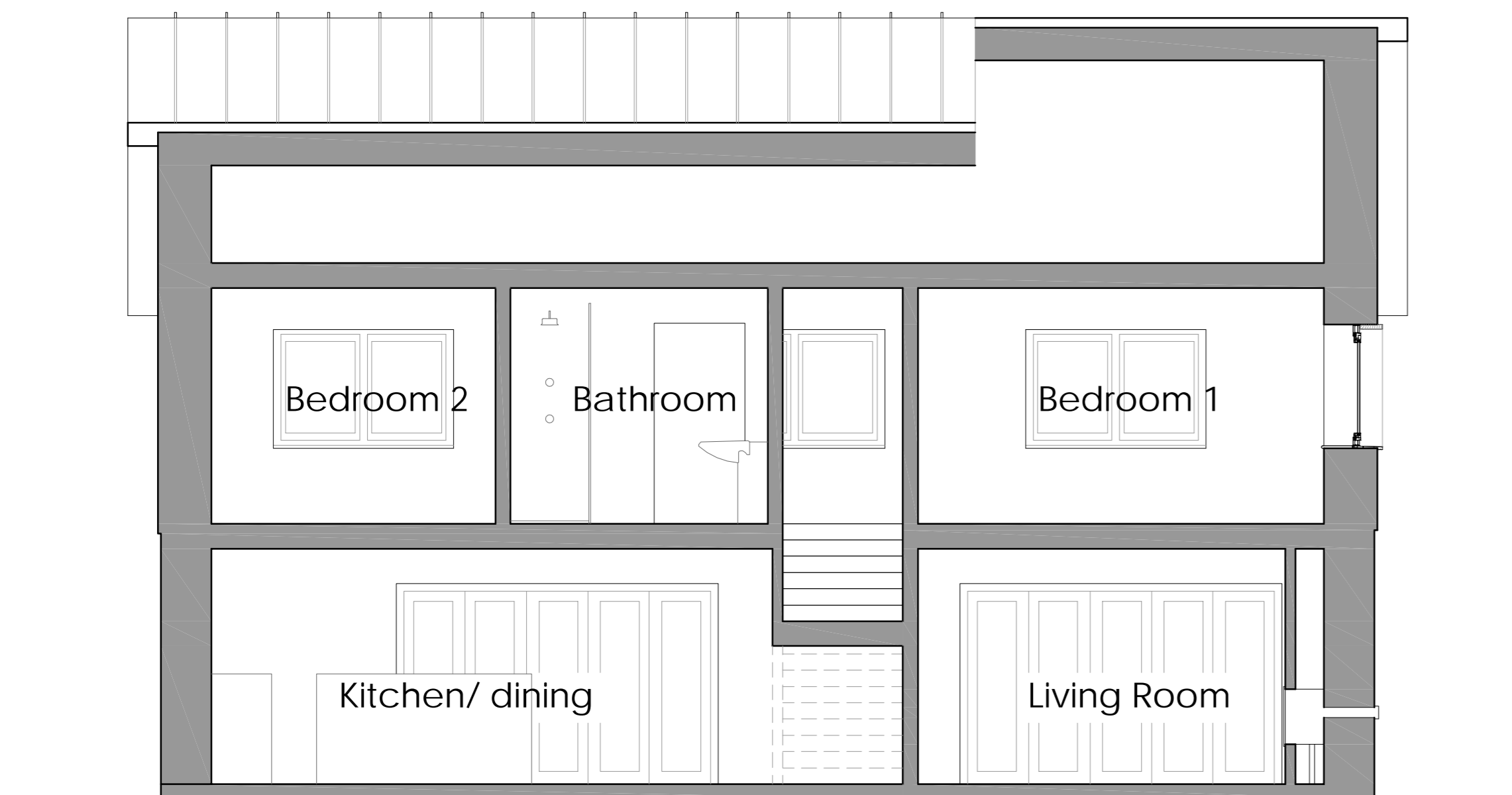
Section X - X

This drawing is to be read in conjunction with all the relevant Architect, Consultants and/or specialists drawings and specifications and any discrepancies are to be notified to the Architect before the affected work commences.